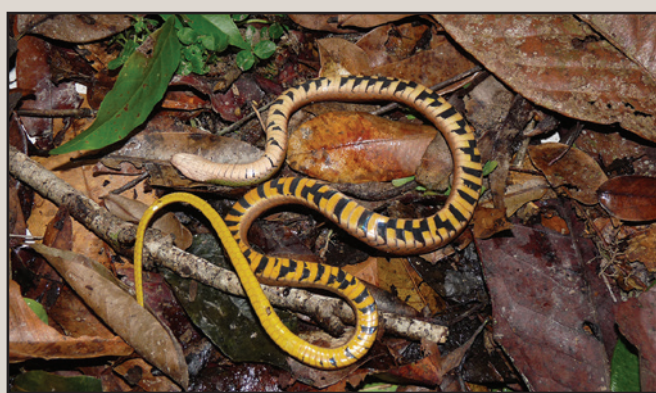
FIG. 1. Erythrolamprus reginae performing death-feigning in Vila Bela da Santíssima Trindade, Mato Grosso, central-western Brazil.