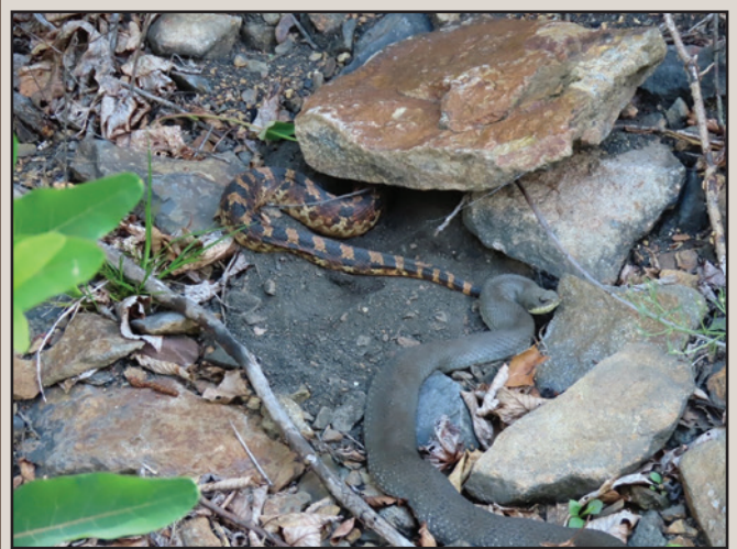
FIG. 1. Patterned Heterodon platirhinos excavating a burrow along a railroad embankment in Pennsylvania, USA. A second large gravid female sits next to it, likely waiting to contribute to communal nest.

At 0815 h on 7 June 2021, a brightly patterned H. platirhinos was observed excavating soil on the bank of a railroad in Carbon County Pennsylvania, USA. It appeared to be post-partum due to extreme emaciation and tapering of its lower body. Brief observations and pictures were taken to minimize disturbance and interruption of behavior (Fig. 1). At 0923 h the same individual was observed to still be excavating the nest but was also joined by a second large melanistic H. platirhinos . The melanistic individual remained stationary in proximity of the first individual but did not have any obvious interactions with that snake. A similar behavior to this was noted by Cunnington and Cebek (2005, op. cit. ) which they speculated could be evidence of a communal nesting site. Since the melanistic individual still appeared gravid, I think it was assessing that location as a potential oviposition site. This is also supported by evidence that eastern hognose snakes are solitary snakes except for incidences of group nesting and courtship/copulation (Platt 1969, op. cit. ). At 1215 h a third individual was found excavating in the soil embankment of the railroad (0.8 km from first individual; Fig.