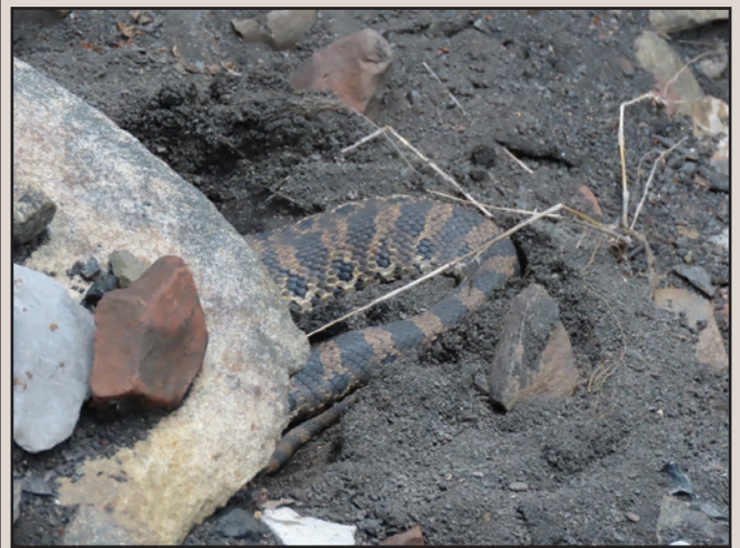
FIG. 2. The third female H. platirhinos observed on 7 June 2021 in Pennsylvania, USA. This individual displayed nesting behavior consistent with previously described accounts of nesting in the literature.

2). The head and the tail of the snake were obscured, with a loop of its body showing, which is consistent with nesting behavior described by (Cunnington and Cebek 2005, op. cit. ). Substrate had evidently been pushed out by the snake in this excavation process. While it would have been nice to confirm that these were nests, excavating nests is unwise, especially since nest site fidelity in other reptiles is well supported (Bonnet et al. 2021. Herpetol. J. 31:142–150).